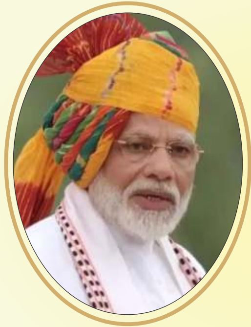
Shri Narendra Modi Prime Minister of India

“And so I declare from the Red Fort today that in the days to come, we will take forward the Jal Jeevan Mission. The central and the state governments will jointly work on this Jal Jeevan Mission. We have promised to spend more than Rs. 3.50 lakh crores on this mission in the coming years... ...in the next five years, we have to do more than four times the work that has been done in the last 70 years.”.